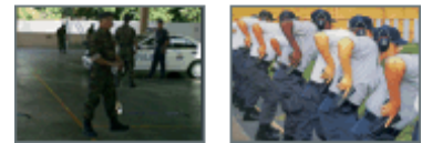
CTP Training Images

The manual describes the various duties performed by a close protection officer, in addition to providing such services in different scenarios such as in residential or hotel settings. Route selection, "standard procedures," vehicle tactics, cover techniques, team surveillance and countermeasures are also covered in this manual. Other topics include the understanding of various equipment such as handguns, light intensifiers, batons, explosives, ballistic armour, and first aid. etc.