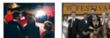
Cannes Film Festival