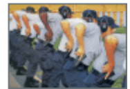
CTP Training Images

The manual describes the various duties performed by a close protection officer, in addition to providing such services in different scenarios such as in residential or hotel settings. Route selection, "standard procedures," vehicle tactics, cover techniques, team surveillance and countermeasures are also covered in this manual. Other topics include the understanding of various equipment such as handguns, light intensifiers, batons, explosives, ballistic armour, and first aid. etc.