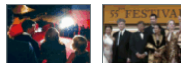
Cannes Film Festival