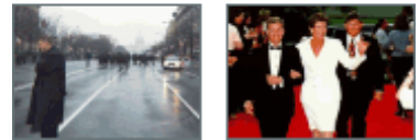
American Music Awards